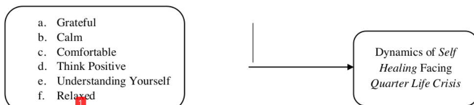
1 Figure 2. Dynamics of Self-Healing Facing Quarter Life Crisis in Students

1 Figure 2 about the dynamics of self-healing facing a quarter life crisis can be described first from the existence of doubts in making decisions. This vacillation is related to determining career choices later where in this study is a final year student they are faced with career determination doubts, namely because of the incompatibility of what they are currently living with what they want, and also the existence of several choices faced makes them feel hesitant in determining the best job for themselves. Anxiety is also one of the dimensions of feelings found in this study, this anxiety occurs because the subject is a final year student where they think more about how the future will be whether they are able to meet the expectations they want and also meet the expectations of people around them such as one of the family.