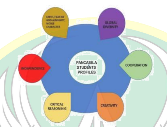
Figure 7. Description of Pancasila Students Profiles at Education units (Nurhayati, et. al, 2022)

Pancasila students, as well as developing independent subjects. This is in line with "Penguatan Project Pelajar Pancasila" in Figure 7 as follows: