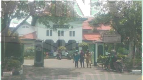
Figure 1. Research Location

This research was carried out at the State Junior High School 2 Bandung City, which is located at Jalan Sumatra No.42, Merdeka, Bandung City, West Java Province. The following is Figure 1 of the research location: