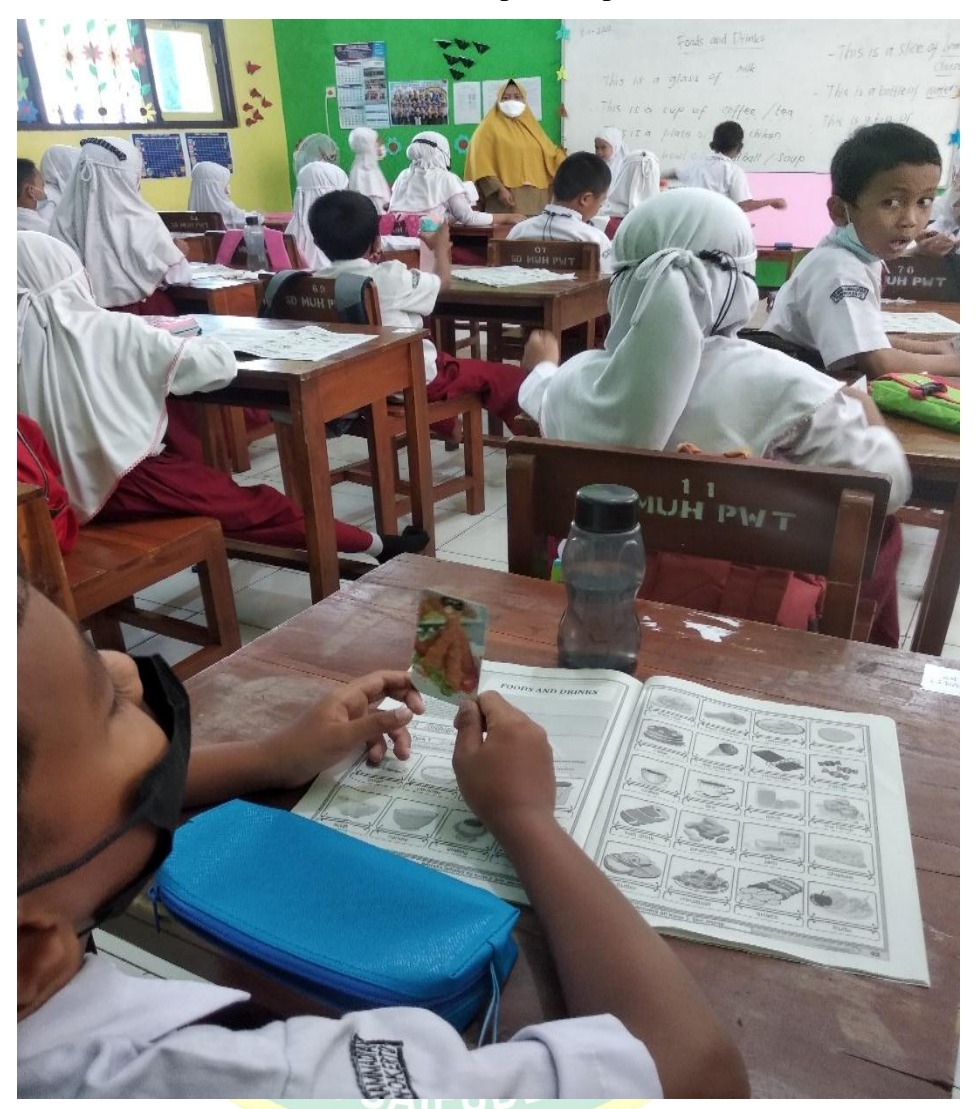
Figure 1. The Distribution of Flashcard

distributed flashcards to students, with each student got a flashcard with the theme of food and drink. For example, the picture below: