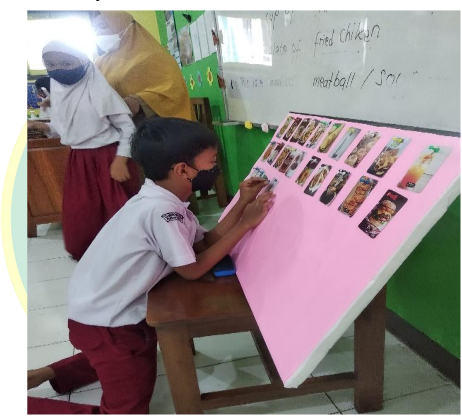
Figure 2. The Arrangement of Flashcard

another student wrote down the flashcard vocabulary that the designated student had presented to come forward. After the students finished presenting the flashcard, the teacher directed the students who had presented in front to paste the flashcards on the cardboard provided by the teacher. After presenting the flashcards in front of them, they had to stick the flashcards on the cardboard to arrange them properly. In addition, the teacher also provides an assessment of knowledge and reading skills to students who had presented flashcards.