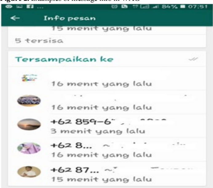
Figure 2. Examples of message info in WAG

The flexibility to do any task related to online class program was one of advantages using WAG for online class. Lecturer 1 taught Reading Comprehension Skill in TOEFL. He made a WAG with 20 participants connected on teaching and learning activities about reading comprehension TOEFL test. Students were instructed to do their module in fifty-five minutes and discuss it in the last fifty minutes of online class time. Lecturers 2 and 3 used two other social media applications to conduct the lessons: WhatsApp and e-mail. They put up WAG to give instructions about the task for the students, to discuss, and to communicate on the topic of learning. The learning media was in the form of documents, slide presentation, link URL, and videos shared in WAG. For submission, the lecturer used e-mail. The researcher is concerned with students experienced in online class using WAG. The lecturers chose e-learning using WAG and e-mail as tools for online class, but it was not used for assessment. WhatsApp was merely used for the student' discussion related to their tasks and for the assessment they have limited offline times to do the TOEFL-like test.