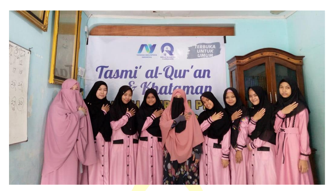
Tasmi' With Supervisor