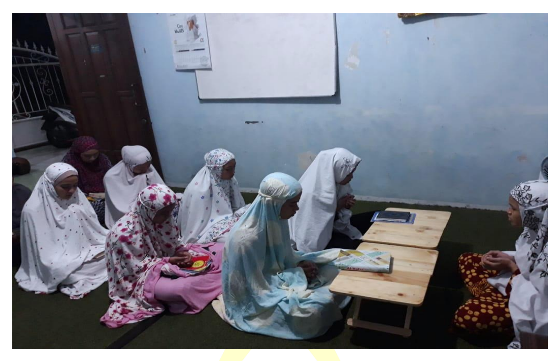
Deposit New Memorization Activity