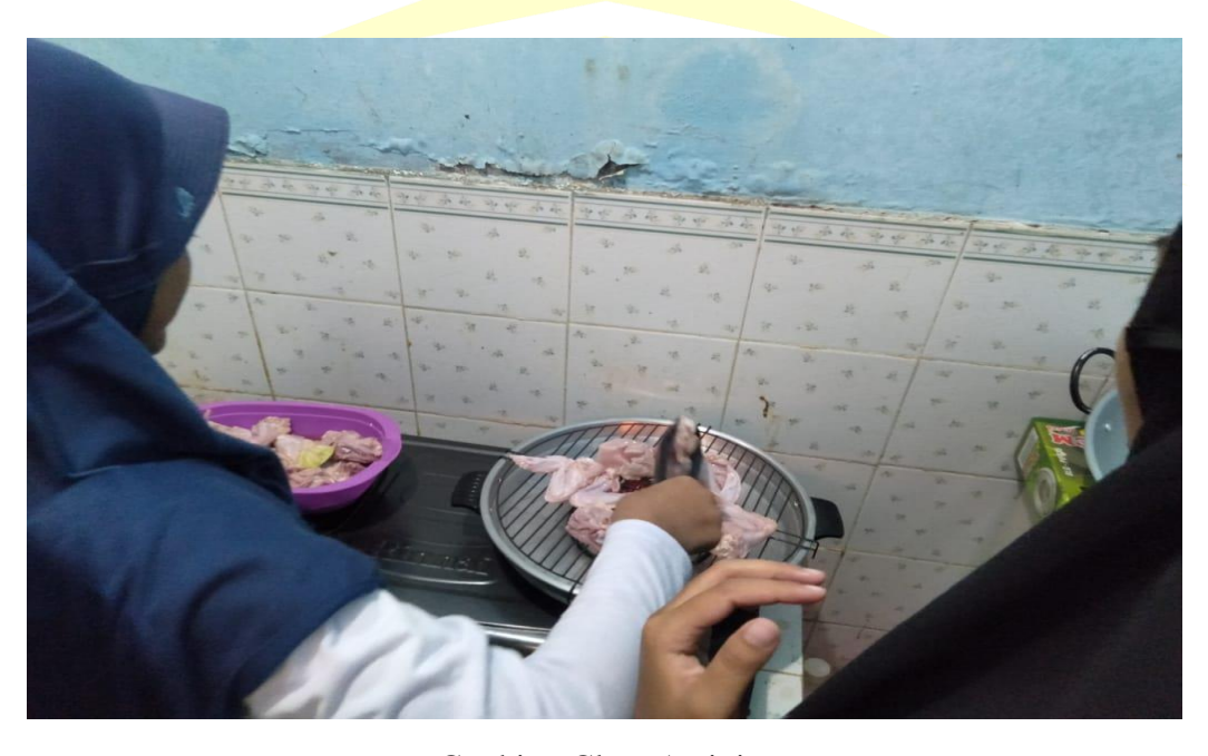
Cooking Class Activity