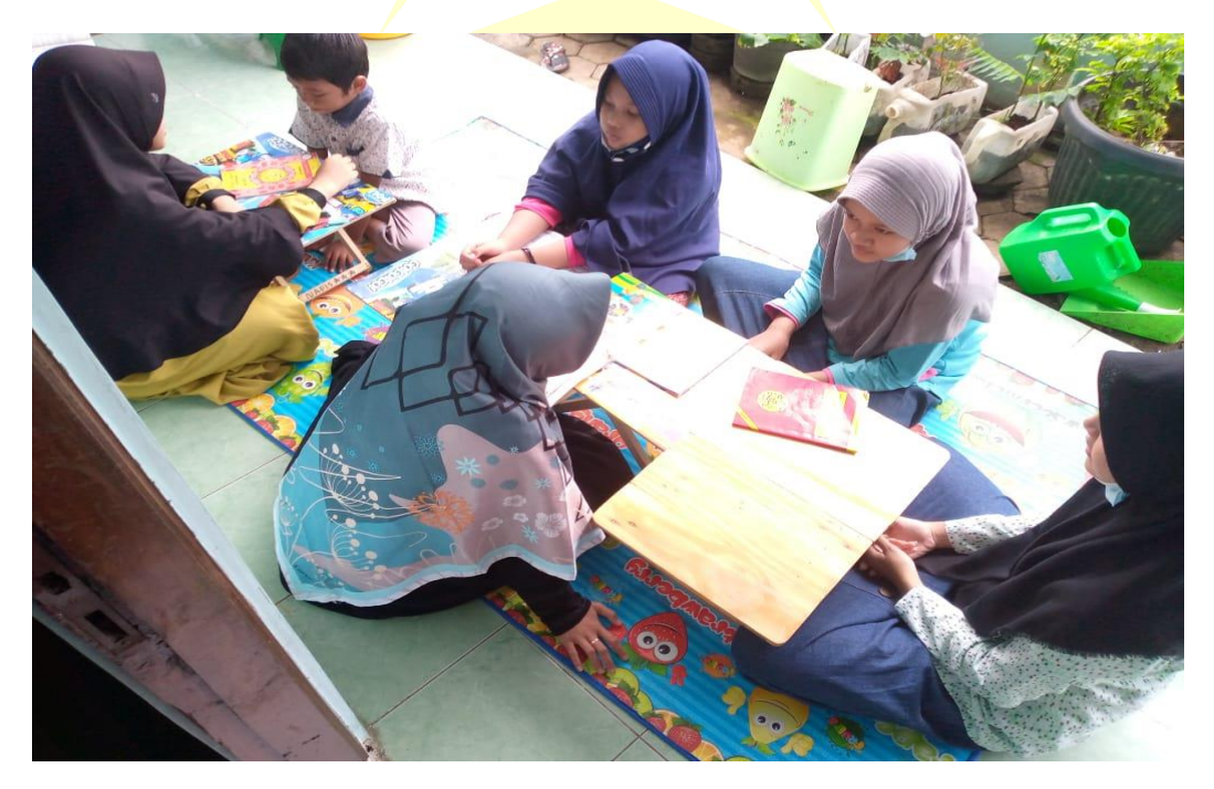
Tahsin for Children Activity