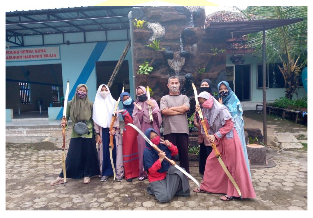
Archery Extracurricular Program